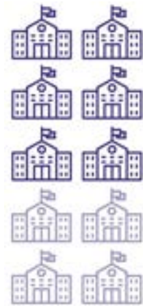
6 in 10 believe schools should protect students' free speech rights

In what almost is a Red State vs. Blue State reality, Millennials and Gen Z both recognized that there are issues with free speech in America, but not all said they were experiencing them. They were almost evenly split on whether they believed that they were not able to speak freely about controversial subjects at school, with 41 percent saying Yes, they felt that pressure to stay silent and 42 percent saying NO, they could speak.