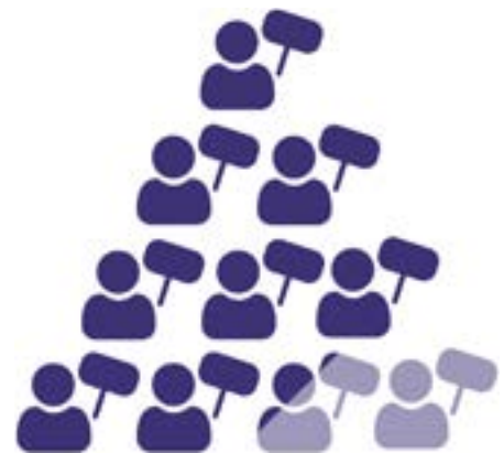
Less than 2 out of 10 want unlimited abortion through all 9 months, for any reason at all and sometimes with taxpayer funding, which Roe allows.

Their more nuanced abortion views broke out many exceptions to the heavy-handed position that Planned Parenthood and the abortion lobby pursues.